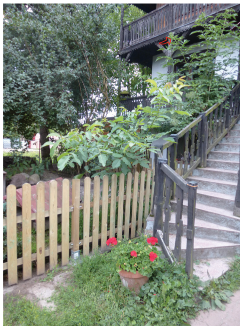
Figure 1. Site of observation; in the foreground, the young walnut with aphids, above (along the stairs), the black elder bush. The location of the D. quadripunctatus nest is indicated with an arrow. Photo taken on 16.07.2017.