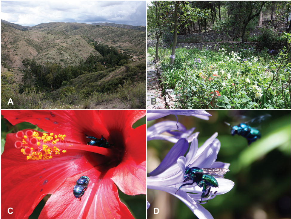
Figure 2. A San Joaquin close to Yotala in Chuquisaca department, surrounded by Eucalyptus (Myrtaceae) trees B garden in San Joaquin C Euglossa melanotricha Moure on flowers of Hibiscus rosa-sinensis L. (Malvaceae) D Exaerete dentata (L.) on flowers of Agapanthus praecox Willd. (Amaryllidaceae).

thus praecox Willd. (Amaryllidaceae) originate from South Africa (Mor et al. 1984) and Hibiscus rosa-sinensis L. (Malvaceae) is introduced from Asia.