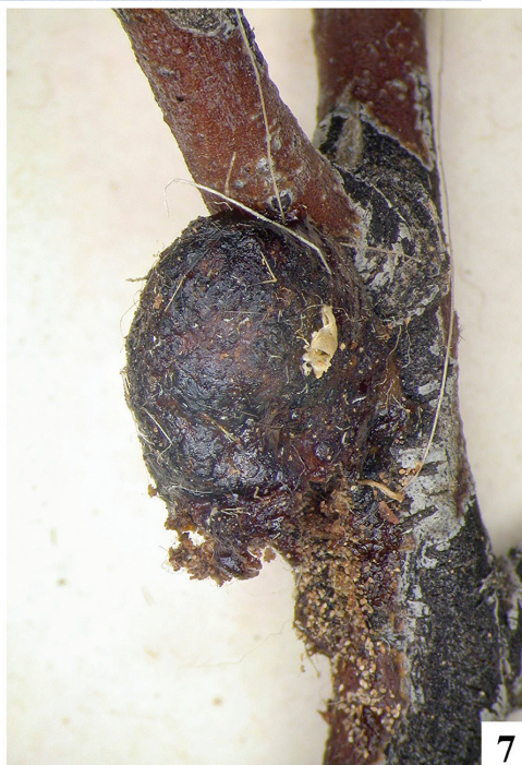
Figures 5–7. Nests of Ananthidium inerme . 5 The two nests examined in this study, which are glued to a paper card, are deposited in the insect collection of the Berlin's Naturkunde Museum, Germany 6, 7 Close up views of nests 1 and 2 taken under a stereomicroscope.