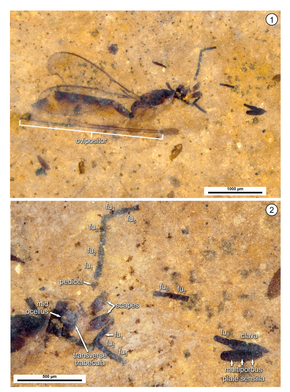
Figures 1, 2. Eotriadomeroides abjunctus Huber, holotype female I habitus (except most legs not visible) 2 pronotum + head + partly disarticulated antennae.

Derivation of species name. From the Latin abjunctus , meaning disunited or separated, refers both to the strongly disjunct geographic distribution of this 40 my old fossil from extant members of Neotriadomerus , the most similar looking genus, and to the fact that some of the fossil's appendages are broken into parts (the antennae) or are separated from the body (the legs).