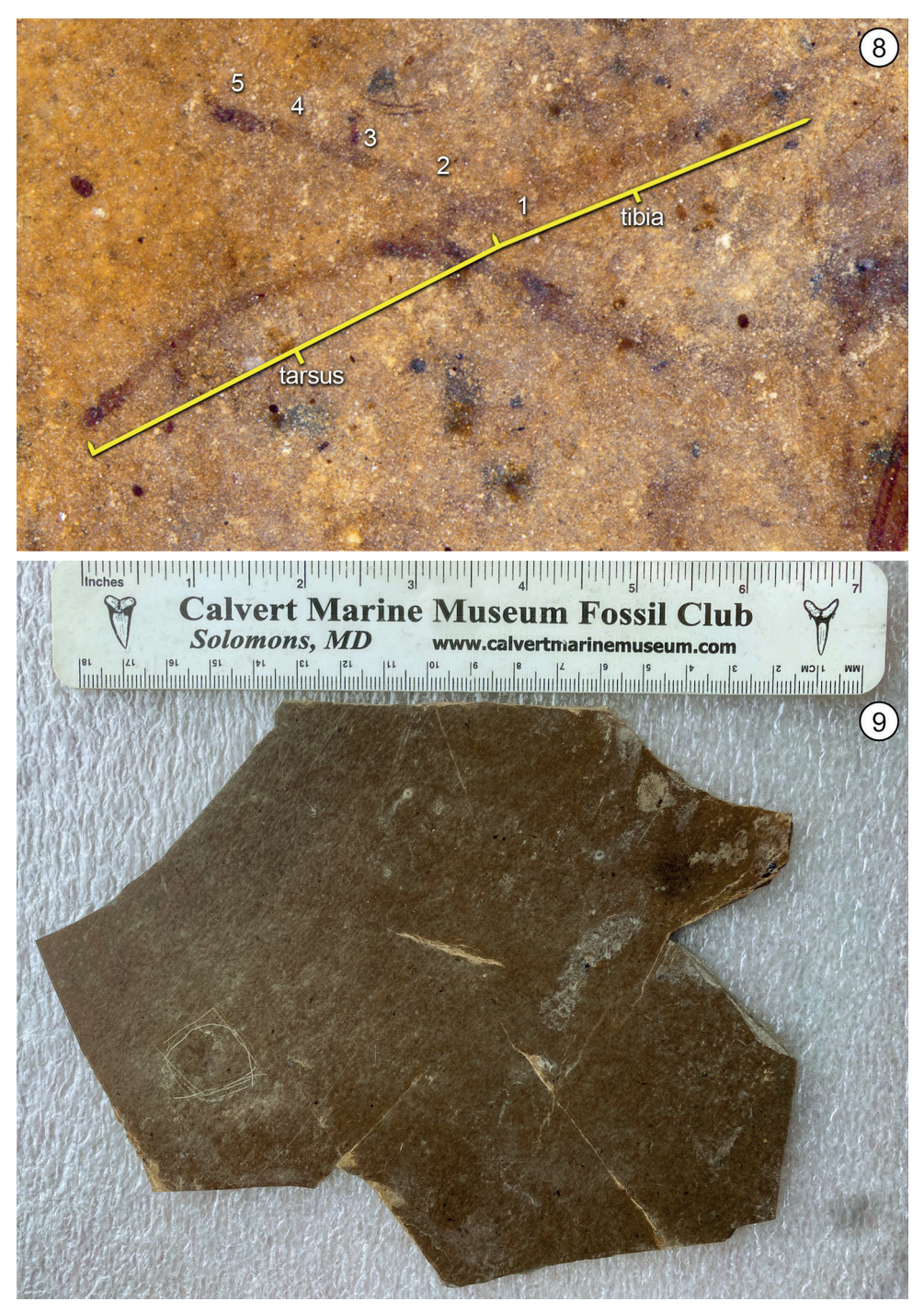
Figures 8, 9. Eotriadomeroides abjunctus Huber, holotype female 8 tibiae and tarsi of one? pair of legs 9 shale piece containing holotype (circled) of Eotriadomeroides abjunctus Huber.