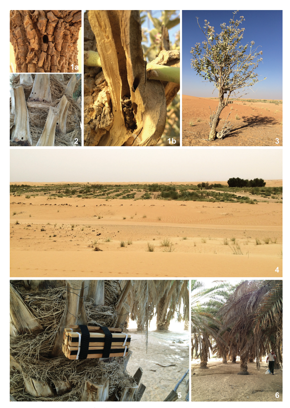
Figures 1–6. 1a, b Branches of Calotropis procera : a opening to boring b cut longitudinally to show a boring with at its base nest cells of a leaf cutting megachilid bee 2 Boring openings in the leaf bases of Phoenix dactylifera 3 C. procera tree outside the drip irrigation area at Tawi Ruwyyan with a bundle of trap-nests suspended from a branch 4 Tawi Ruwayyan, looking from the C. procera tree towards the drip irrigation area 5 Trap-nest bundle on trunk of Phoenix dactylifera in the date palm grove at the Camel Farm 6 Date palm grove at the Camel Farm.