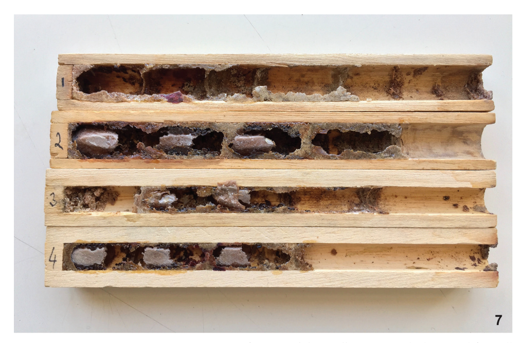
Figure 7. Trap-nests 1–4 as at 25 May 2016 after Megachile maxillosa imagines had emerged from all of the cells. Trap-nest 3 shows the remains of the nest of Pseudoheriades grandiceps that preceded the nest of M. maxillosa .

In completed nests the opening of the boring had been sealed with a 3 mm thick plug of sand and resin in consistency similar to that of the cell walls and closures. The empty space, the vestibular cell, between the last cell and the closure varied from 12 to 40 mm. In one of the nests the vestibular cell had been divided into two and in another three compartments (Fig. 7, trap-nests 3 and 1).