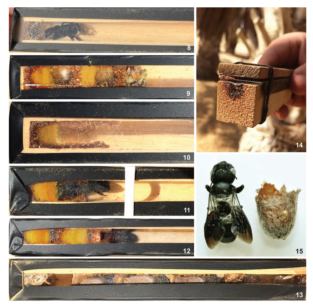
Figures 8–15. 8 Trap-nest 2 of trap-nest bundle at Tawi Ruwayyan on 27 April 2015, showing Megachile maxillosa initiating a cell 9 Trap-nest 1 of trap-nest bundle at Tawi Ruwayyan on 27 April 2015, showing two closed cells of M. maxillosa followed by leaf pieces, presumed to be those of a leaf cutting Megachile sp. 10 Trap-nest 2 of trap-nest bundle at Tawi Ruwayyan on 28 April 2015, showing first cell being provisioned by the builder, M. maxillosa 11 Trap-nest 4 of trap-nest 4 of trap-nest bundle at the Camel Farm on 27 April, showing one open cell being provisioned by M. maxillosa 12 Trap-nest 4 of trap-nest 4 of trap-nest bundle at the Camel Farm on 28 April 2016, showing two closed provisioned cells with M. maxillosa initiating a third cell 13 Trap nest 3 of trap-nest bundle at the Camel Farm showing nest of Pseudoheriades grandiceps at inner end followed by three-celled nest of M. maxillosa 15 M. maxillosa female imago (actual length approx. 22 mm) with open cocoon.

When PAR inspected the nests in early April 2016 no imagines had emerged but by 11 May five females and four males had emerged (Figs 7, 15).