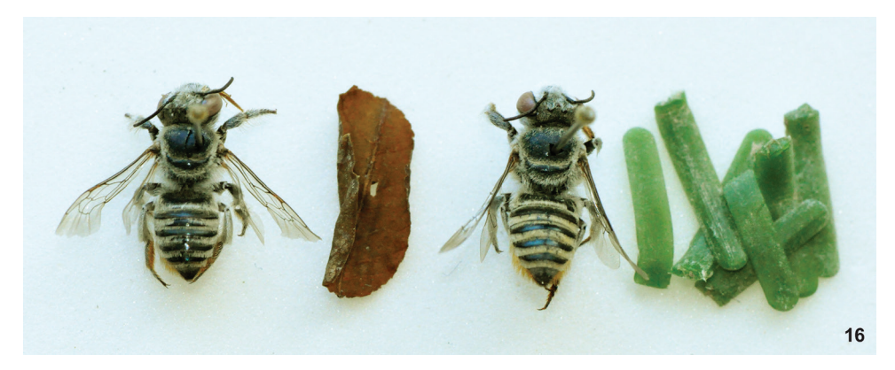
Figure 16. Megachile patellimana: female (actual length approx. 16 mm) with a leaf piece (green and fresh when collected) and female (actual length approx. 16 mm) with cut lengths of plastic, one from female and the rest from her nesting burrow.

between M. semifulva and M. bucephala (C. Praz, pers. comm.)). These observations "Nests in ground 6-7 inched vertical; lined with blade of certain grass, selected them before biting; measures it by running up and down. The pieces varied in length from 3-4 inches. St. W. Warley, 29.X.1916" quoted by Pasteels (1965: page 127) are from manuscript copies in the Natal and Durban museums.