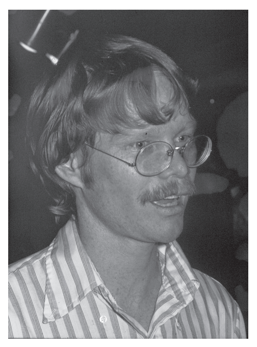
Figure 1. Justin O. Schmidt early in his post-doctoral career.