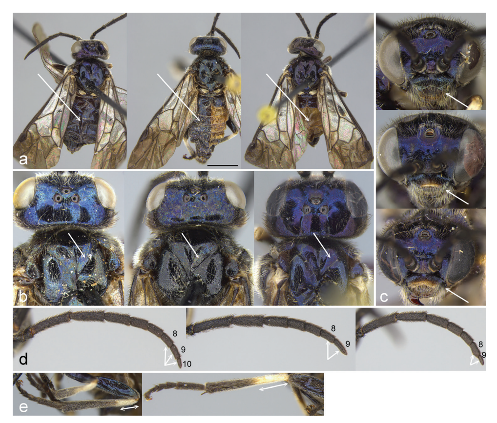
Figure 1. Neostromboceros albicomus , various specimens, both sexes. a color of abdomen (females, scale 2 mm) b color and density of pits on mesonotum c color and shape of clypeus d shape of apical antennomeres e color of hind tibia.