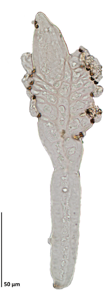
Figure 2. Photograph of a slide-mounted Rickia wasmannii thallus (deposition number: G00562301) from Myrmica hellenica host, recorded on the AntWeb (specimen: CASENT0907653).