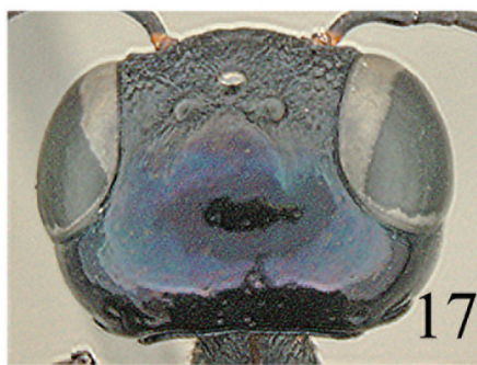
Figures 13–17. Callexiphyda caledonia . 13 Lateral 14 Head and thorax lateral 15 Thorax dorsal 16 Head front 17 Head dorsal.