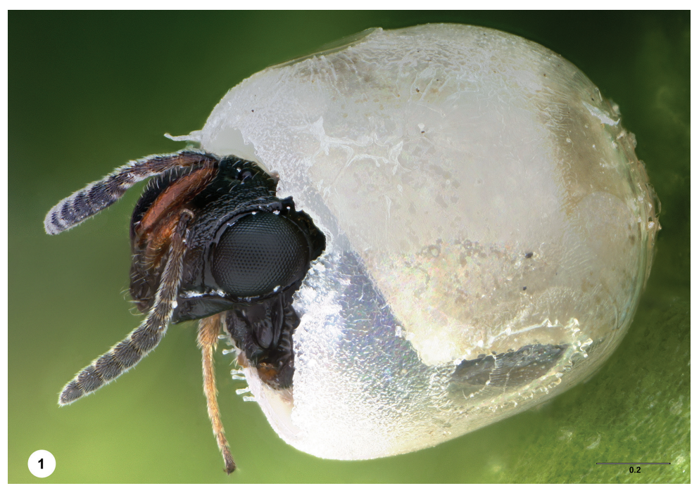
Figure 1. Trissolcus japonicus , female (USNMENT01059357), specimen preserved during emergence from BMSB egg. Scale bar in millimeters.<sup>1</sup>

sequenced in the Scheffer Laboratory (USDA/ARS, Systematic Entomology Laboratory) and compared with sequences obtained from populations of previously identified Asian Trissolcus from Asian field surveys (Bon et al., unpublished). Voucher specimens for all molecular data are deposited in the National Insect Collection of the National Museum of Natural History, Smithsonian Institution, Washington, DC.