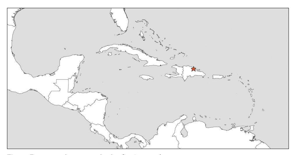
Figure 7. Diagram showing type locality for Grotea ambarosa sp. nov.

area lateralis not fully enclosed. Posterior transverse carina absent. Forewing crossvein 1cu-a arising distinctly distad of M&Rs. Aerolet large and pentagonal, about 1.6× as wide as long.