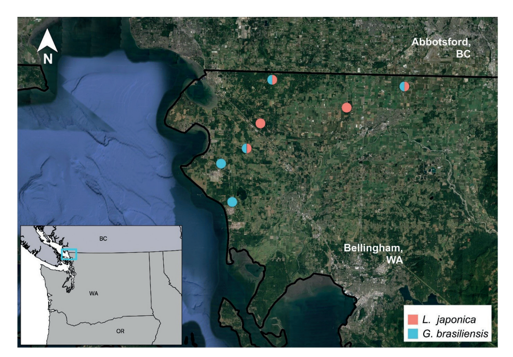
Figure 3. Map of G. brasiliensis and L. japonica detections in northwestern Washington State, US in 2020–2021. Markers with both colors indicate both species were found at that site. Symbols represent presence or absence and are not indicative of relative abundance. Map tiles by Stamen Design, under CC BY 3.0. Data by OpenStreetMap, under ODbL.

In the 1990s, Colpoclypeus florus (Walker) (Hymenoptera: Eulophidae), a European leafroller parasitoid, was found in Washington (Brunner 1996), likely well after it had been established for many years. At the time of its identification, it was already considered to provide substantial levels of biological control, and became the centerpiece of further studies to increase its impact through conservation (Pfannenstiel et al. 2010; Unruh et al. 2012). In 2014, Anagyrus schoenherri , (Westwood) (Hymenoptera: Encyrtidae) a parasitoid of apple mealybug, Phenacoccus aceris , (Signoret) (Hemiptera: Pseudococcidae) was identified for the first time in North America (Bixby-Brosi et al. 2017). This European species was well known from this cosmopolitan pest elsewhere, but had gone unnoticed in the US; however, it is likely this parasitoid was present as early as 2007 in Washington (EHB, unpublished). The discovery of the Asian egg parasitoid Trissolcus japonicus (Ashmead) (Hymenoptera: Scelionidae), which attacks