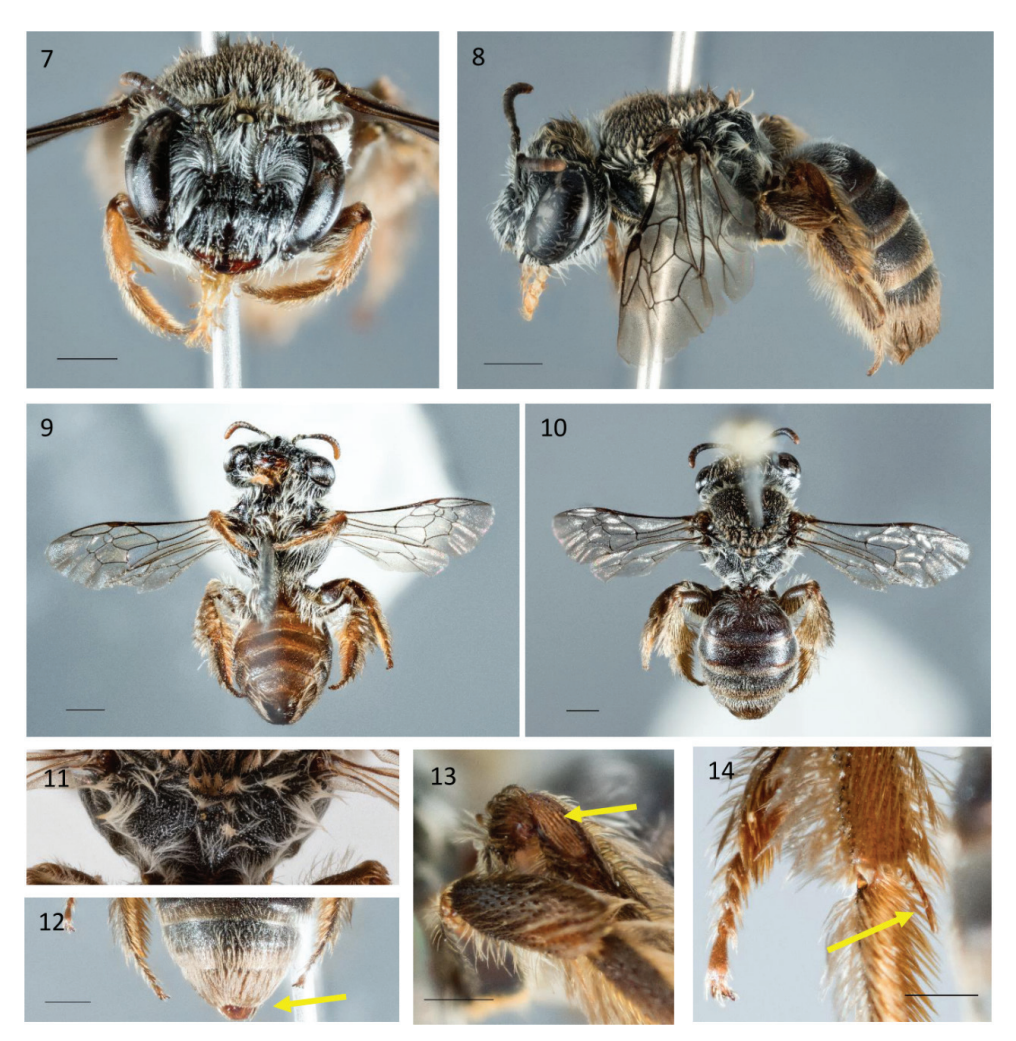
Figures 7–14. Leioproctus zephyr sp. nov., female. 7 Head, frontal view 8 Lateral habitus 9 ventral view 10 dorsal view 11 propodeal triangle 12 pygidial plate 13 basitarsal plate 14 inner hindtibial spur. Scale bars: 1 mm ( 1–5 ); 0.5 mm ( 6–7 ).

approximately equal in length; maxillary palpus extremely short, not reaching base of prementum and labial palps short, not reaching apex of paraglossa; paraglossa large, triangular; glossa strongly bifurcate, more so than in most Australian Leioproctus , with a long, dense apical fringe; clypeus convex, broader than long, with a medial longitudinal ridge and distinct protuberance in middle of upper half, protuberance triangular in profile, apex above clypeal midlength and almost one quarter length of head, with smaller protuberance at base of median ridge; clypeus lateral to this medial ridge and below epistomal suture convex; supraclypeal area elevated, surface concave, somewhat triangular; frontal line continuous with median ridge strongest at level of antennal sockets, extending to the medial ocellus; compound eyes slightly more convergent