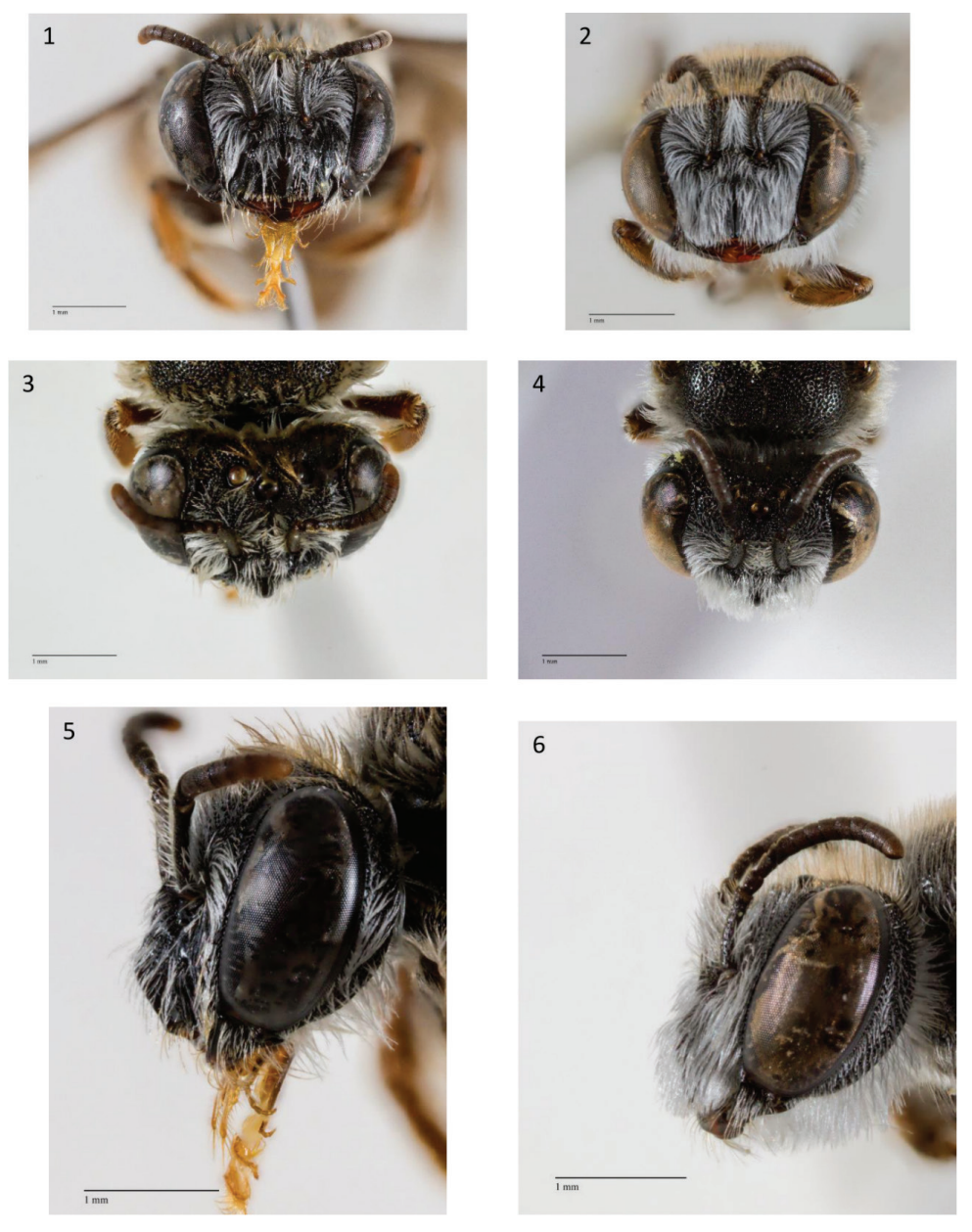
Figures 1–6. Leioproctus zephyr sp. nov., emphasising the protruberant clypeus. Frontal view 1 female 2 male; dorsal view 3 female 4 male; lateral view 5 female 6 male.

The holotype, allotype and paratype specimens are bequeathed to the Western Australian Museum.