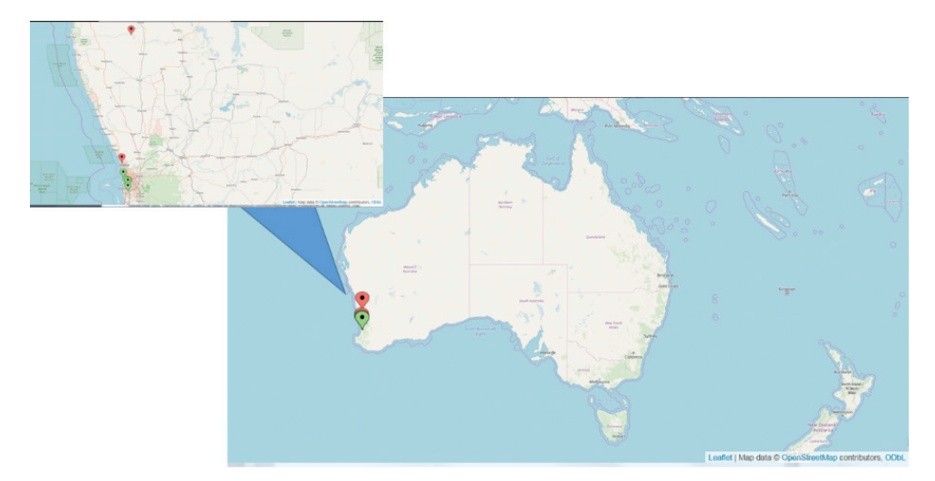
Figure 24. Map of Australia showing sites where specimens of Leioproctus zephyr sp. nov. has been collected, with close-up of locations. Green locations: collection localities by the author in 2016–18; red localities: collection locations by T. F. Houston 1979, 1992, 1996, 1997. Refer to Table 1 for further information. Map produced via the online program MapCustomizer: https://www.mapcustomizer.com/.

Ecology. Months collected: Dec – Jan. Earliest collection date by the author 3-Dec 2016, latest collection date 8-Jan 2017. The latest date collected was 29-Jan 1979. Floral visitation: Most visitation records have been from Jacksonia sericea Bentham (Fabaceae) (Suppl. material 1). The species has previously been collected mainly from J. sericea , with three records of bees visiting J. eremodendron E. Pritz, and one record of a bee visiting J. horrida (de Candolle) (however, based on how the distribution of J. horrida does not extend north to where the bee was collected, this is likely a misattribution and this collection record was also from J. sericea (Western Australian Herbarium 2022) (Suppl. material 1).