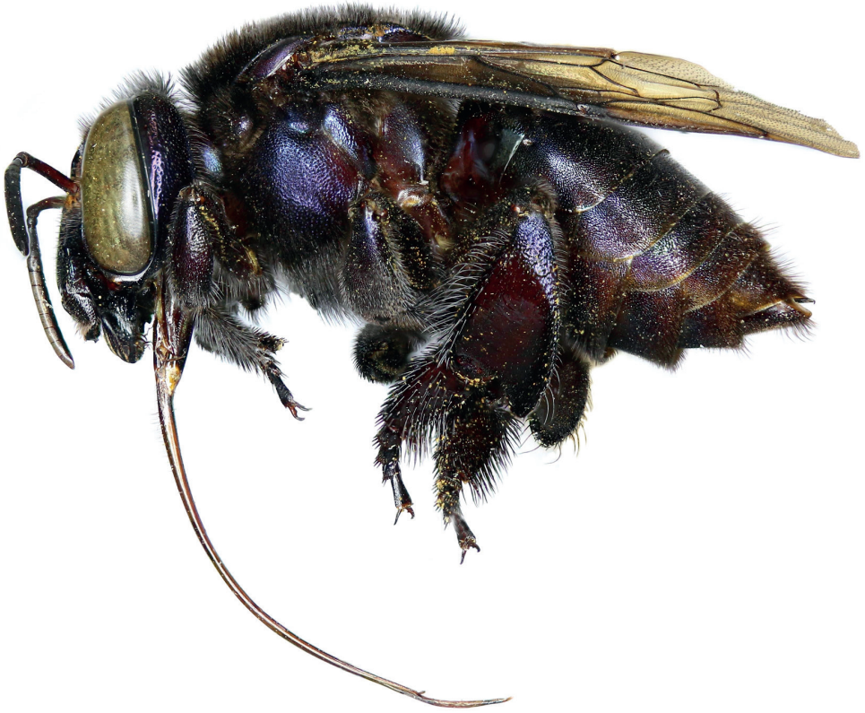
Figure 2. Eufriesea insularis sp. nov., female holotype (IBUNAM RA 292), lateral habitus.

an orthogonal notch between teeth; labrum with coarse irregular punctures, with short elevated medial carinae, larger than sublateral carinae, sublateral carinae converging apically; distal extreme of labrum with subapical depression and distally and distal margin prominently covered with short pubescence; clypeus with elongate punctures (Fig. 7) that converge towards midline, such punctures stronger than those on remainder of face, integument between punctures shining, finely and microscopically imbricate, with prominent elevated medial ridge (Fig. 7); impunctate and shiny area between toruli and inner margin of compound eye, area between torulus and eye exceptionally narrow, about one-fifth torular diameter; frons doubly punctate, largest punctures separated by about their diameter, integument between punctures smooth and shiny; frontal line well defined between torulus and anterior margin of median ocellus (1.55 mm, 1.53–1.67 mm long); supraclypeal area with impunctate line extending to clypeal margin. Scape length 2.1 mm (2.1–2.2 mm), midlength width 0.33 mm (0.32–0.33 mm), apical width 0.41 mm (0.41–0.42 mm); pedicel length 0.30 mm (0.28–0.30 mm), flagellum length 3.8 mm (3.8–4.0 mm), width 0.40 mm (0.38–0.42 mm), flagellomere I length 0.45 mm (0.45–0.46 mm), flagellomere II length 0.32 mm (0.32–0.33 mm); distance between antennal torulus and compound eye 0.75 mm (0.75–0.81 mm), with punctures small and dense in respect to those of frons; torulus width 0.50 mm (0.49–