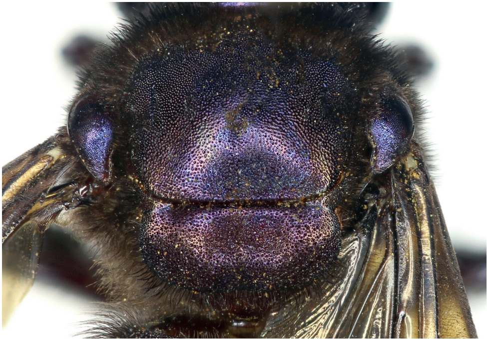
Figure 6. Eufriesea insularis sp. nov., female, dorsal view of mesoscutum and mesoscutellum.

in respect to upper tangent of compound eyes. Mesoscutum width 5.5 mm (anterior inter-tegular distance) (5.5–5.7 mm), length 4.9 mm (4.9–5.1 mm); mesoscutum and mesoscutellum with dense punctation, punctures separated by less than a puncture width (Fig. 6), integument between punctures smooth and shiny; tegula with small and uniform punctation, although with some larger punctures along mesal margins, mesal margin demarcated by narrow furrow; mesoscutellum width 4.6 mm (4.3–4.7 mm), length 2.8 mm (2.8–3.0 mm); mesoscutellum slightly rounded in profile, with exceptionally weak medial depression, posterolateral angles rounded; propodeum posterior surface generally smooth, with only fine setigerous punctures; forewing length 15.2 mm (15.1–15.2 mm), width 4.8 mm (4.8–5.1 mm); jugal comb present at base of hind wing, setae of jugal comb longer than width of jugal lobe; distal area of hind wing homogeneously papillate. Metatibia medial length 5.9 mm (5.4–5.9 mm), width 2.8 mm (2.8–3.0 mm); metabasitarsus length on posterior margin 2.7 mm (2.7–3.0 mm), width at base 1.4 mm (1.3–1.6 mm). TI with punctures larger than those of remaining terga, with posterior marginal zone impunctate and longer than those of remaining terga; TII–IV with small, homogeneous punctation, distance between punctures similar to their diameter; TV–VI with punctation denser than on preceding terga; TII–IV with marginal zones short, narrow, impunctate (Fig. 5).