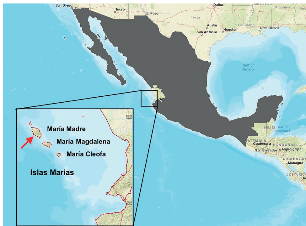
Figure 1. Geographical location of the Mariás Islands in the Pacific Ocean, off the coast of Nayarit, México. María Madre Island is the type locality of Eufriesea insularis sp. nov.

ocular area; the clypeus has a prominent mediolongitudinal ridge, strongest in apical half of the clypeus (Fig. 7); frons doubly punctate, the largest punctures separated by about their diameter, between the small and large punctures the integument is smooth and shiny; exceptionally narrow impunctate and shiny area between torulus and inner ocular margin, width about one-fifth torular diameter; scape dark reddish brown, flagellum dark brown to nearly black, but flagellomeres I, II, and apical flagellomeres darker (Fig. 7); pronotum partially dark brown, and lateral margins of mesoscutum, axilla, and mesoscutellum dark brown to nearly black (Fig. 6); forewing hyaline and infumate throughout although darker in costal cell, along anterior margin of marginal cell (particularly apically), and slightly so in first submarginal cell (Fig. 3); lighter patch in second medial cell (Fig. 3); femora, metatibia (corbicula), and metabasitarsus dark brown to nearly black in some areas (Figs 2, 4).