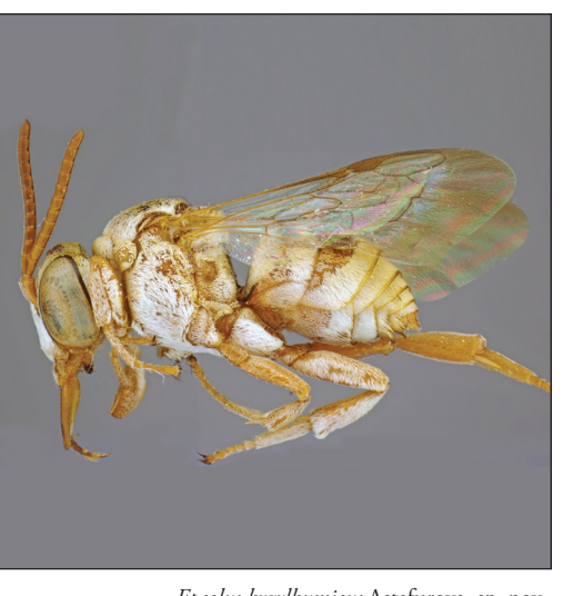
Epeolus kyzylkumicus Astafurova, sp. nov.,